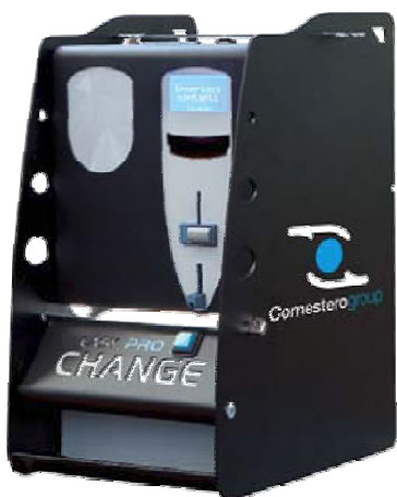
Change Machine without the base