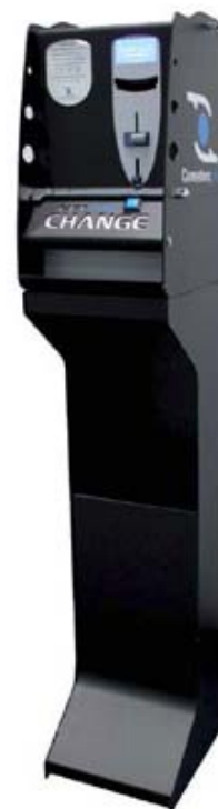
Change machine with base